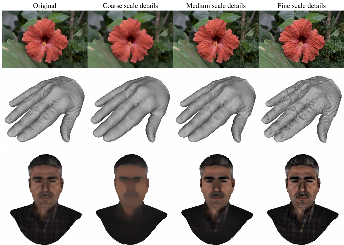
Fig. 2. From top to bottom rows: detail manipulation for an image, a 3D mesh and a 3D colored point cloud. Each column provides a scale of detail manipulation.