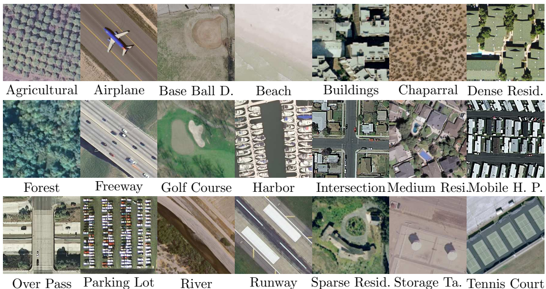
Fig. 1. UC Merced land use dataset.