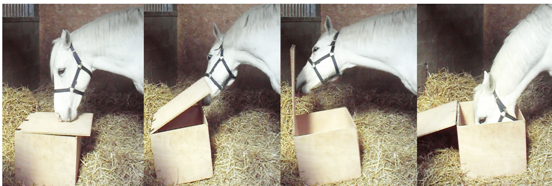
FIGURE 1 | The chest test: example of behaviors. Sniffing the lid/Lifting the lid/Opening the chest/Eating food.