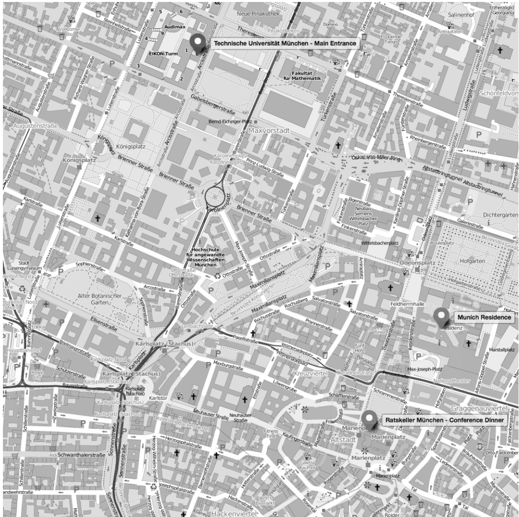
Figure 2: TUM main campus, Munich Residence and conference dinner location.