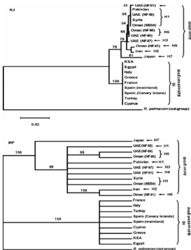
Fig. 3: Phylogenetic hypotheses. Phylogenetic trees were reconstructed using: neighbour joining (NJ) and maximum parsimony (MP) methods, Bootstrap support values (1000 replicates) are indicated above the lines

the total nucleotide sequence diversity ( P_i ) was 0.01238. Number of fixed differences among the different populations of RPW varied from one to seventeen. The nucleotide diversity ( P_i ) among different geographical populations of RPW ranged from 0.00069 to 0.01193 (Table II).