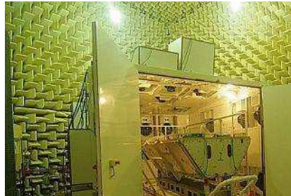
Fig. 3 - Sound synthesis in a satellite testing room

ago in an area of a Swiss city for the ATQ company and is still in use. The emitted signals are measured on a continuous time basis at several distances from the transformer. The second example is more similar to a sound synthesis experiment. It was conducted for Thales Alenia Space. The aim was to produce a diffuse sound field in a room used to test satellite responses to severe conditions (see Fig. 3). The sources are loudspeakers located along the walls which are driven at low frequency by an active control system.