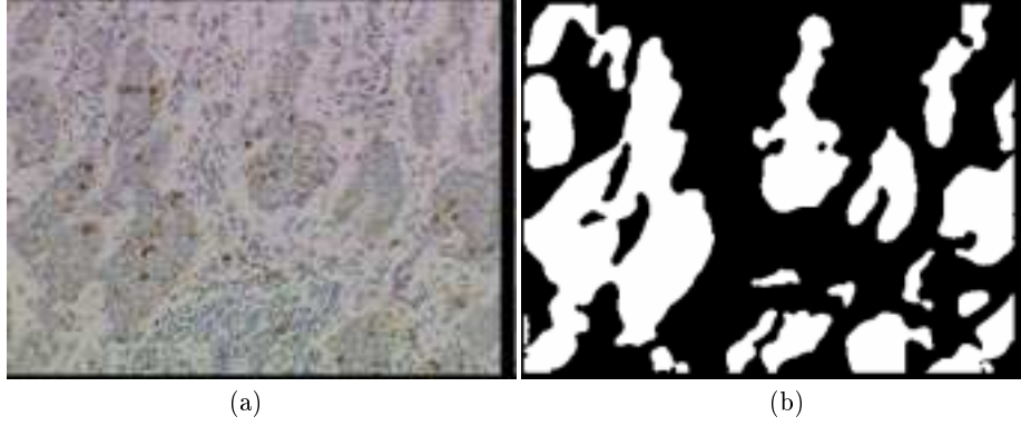
Fig. 2. (a) Original histological breast cancer image ( \times 33 ). (b) Segmentation result: binary mask of lobules.

I_R = I_L * G(x, \sigma_1) - I_L * G(x, \sigma_2) and where G(x, \sigma) is a gaussian function of standard deviation \sigma .