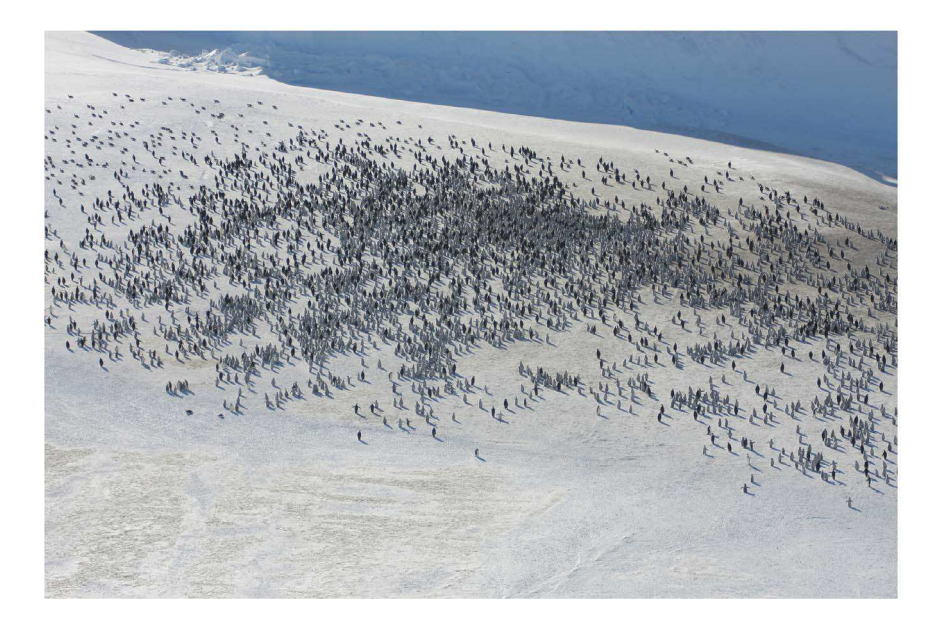
Figure 3. Western emperor penguin colony. Aerial view of the western emperor penguin colony (67°14'S, 145°30'E) showing adults and chicks present on November 2<sup>nd</sup>, 2012. from an altitude of ca. 1,000 feet. doi:10.1371/journal.pone.0100404.g003

due to variability in density and to inter-annual variability. This suggests that this colony was not the only one to be missed by the 2009 and 2012 satellite surveys, and that more colonies remain to be discovered in other parts of the continent. Although not always possible each season due to cloud cover and the availability of the satellite, our results suggest that satellite surveys should be conducted repeatedly and combined with field surveys to ensure that colonies are not missed. Our paper shows that to allow confidence in satellite observations, a multi-temporal/multi-year approach has to be used to ensure that breeding sites are not missed due to heavy snowfall, deep shadows or topographic features such as ice cliffs. If possible, these observations should be backed up with aerial or ground counts as the limited special resolution of satellite imagery results in large inherent variances when calculating breeding populations. Innovative cameras combined with biologging would also be very useful to complete the satellite survey. For instance, since the satellite survey based on 2009 imagery, four more emperor penguin colonies have been discovered: two on the West Ice Shelf detected by aerial survey [27], and two others on the West Ice Shelf and near the Jason Peninsula identified by satellite survey [28].