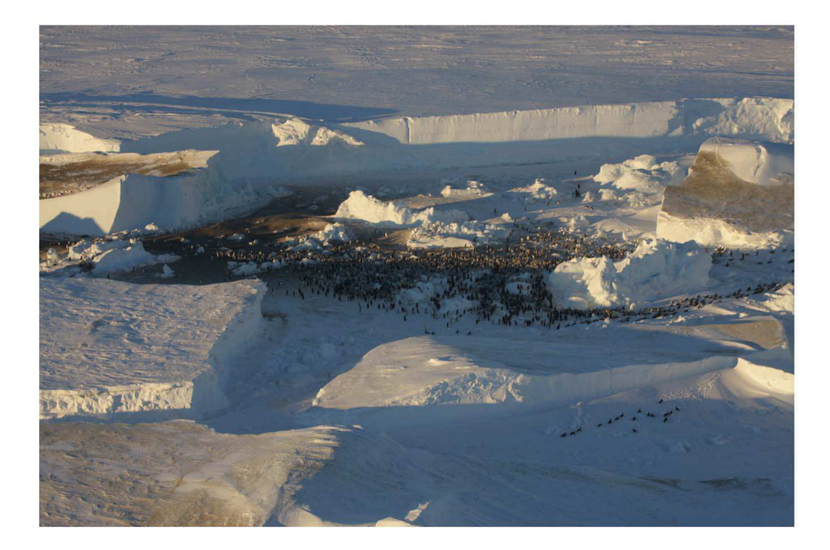
Figure 1. Eastern emperor penguin colony. Aerial view of the eastern emperor penguin colony (67°19'S, 145°52'E) showing adults and chicks present on November 1<sup>st</sup>, 2012. Photograph by Robin Cristofari, from an altitude of ca. 1,000 feet. doi:10.1371/journal.pone.0100404.g001

500 m during a helicopter flight involved in resupply operations. This western colony was located on a large and flat fast ice sheet extending from the Mertz glacier, ca. 20 km west of the first colony, at 67°14'S, 145°30'E (Figure 3). This colony was bordered on the north-west by a high ice cliff of the Mertz glacier. Numerous large tabular icebergs were grounded in the fast ice, south of the colony. This habitat was similar to that generally found in the Ross Sea area, characterized by stable fast ice, nearby open water and access to fresh snow [25]. The site was poorly sheltered from the wind. The colony comprised one single group of ca. 3,980 downy chicks, and 2,300 adults. From empirical observation, these chicks seemed bigger, and better fed, than those of the eastern colony. Three Antarctic skuas Catharacta maccormicki and one giant petrel Macronectes giganteus were sighted flying over the colony. Only 17 dead chicks and one abandoned egg were found during our 3-hour survey, some of them partly buried. The ice surface was of heavily compacted and abraded snow, and it is therefore most likely that more dead chicks were buried beneath the snow surface. Guano traces were restricted to the area currently occupied by the birds, and its direct surroundings. Due to these difficult conditions, we were unable to precisely locate the incubation area. As for the first colony, we did not observe any individuals bearing flipper-bands.