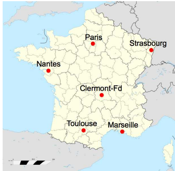
Figure 3. Studied locations in France