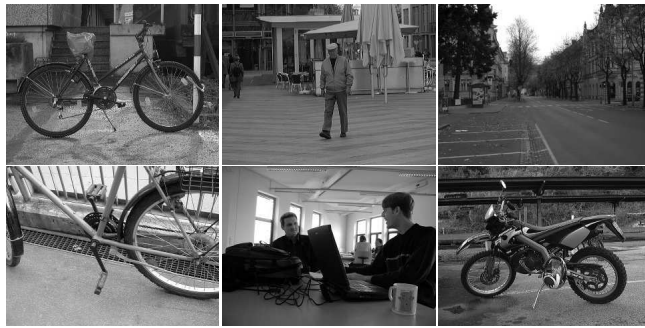
Fig. 4 Some examples of bikes (left column), persons (middle) and background (right) taken from Graz-01. Only parts of the objects of interest may be visible, and the background class features difficult counter-examples to the bike class, such as motorbikes