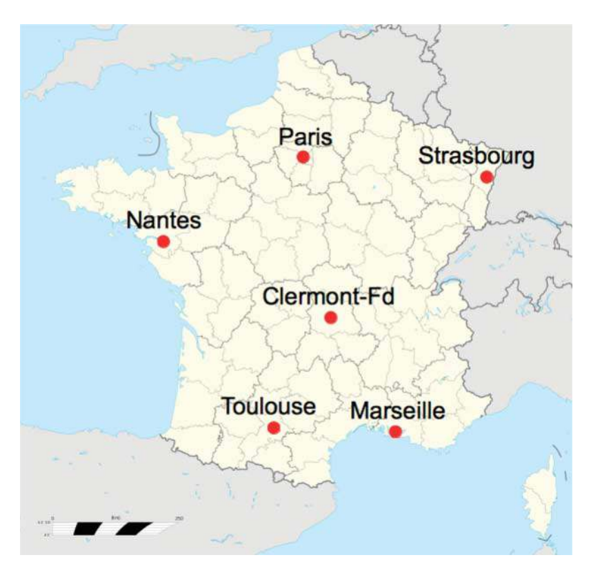
Figure 3. Studied locations in France.