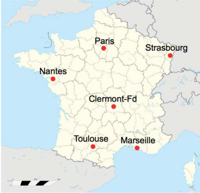
Figure 3. Studied locations in France.