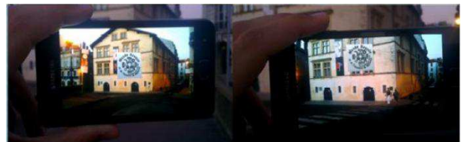
Figure 2. Plasticity of augmentations

The figure below highlights the obtained results: