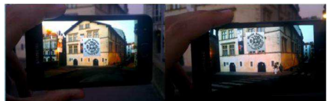
Figure 2. Plasticity of augmentations

The figure below highlights the obtained results: