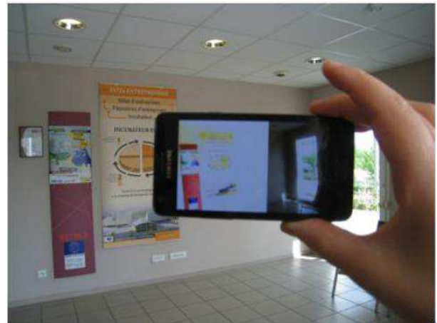
Figure 4. Illuminating real scene

We remember the reader that the objective of our application is to adjust the lighting level of the scene to the value of the ambient light. In this sense, when the user is in full sunlight, the application enables to darken the camera frames. Otherwise, the application allows illuminating the real scene. For this purpose, \beta and \alpha values should be reversed. The following figure shows the obtained results: