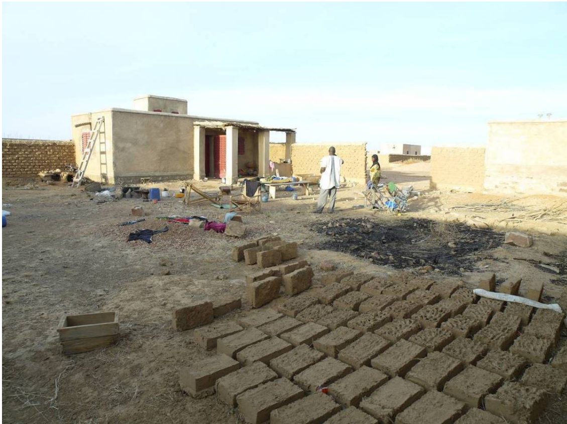
Fig.6 – Adobes ready for the self continuation of the recovery