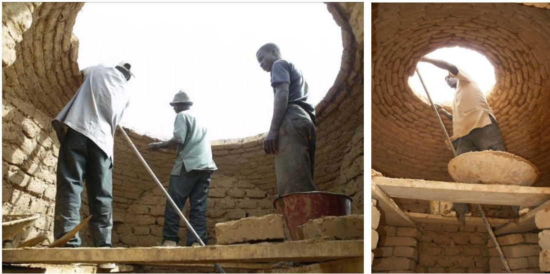
Fig.5 – Construction of cuploas

A supplementary training session was organised during this phase, in February 2010, for the construction of kitchens that were built without wood, and whose roofs were domed, made from unfired earthen bricks (adobe). The transmission of skills having been done, the local team carried out the next cupola projects independently.