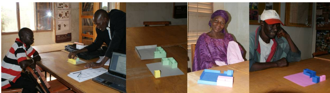
Fig.4 – Work sessions with the beneficiaries

Each “dossier family” was finally established with the following documentation: