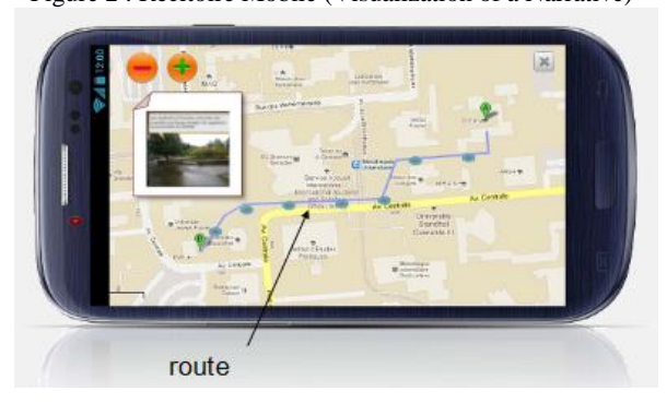
Figure 2: Recitoire Mobile (Visualization of a Narrative)