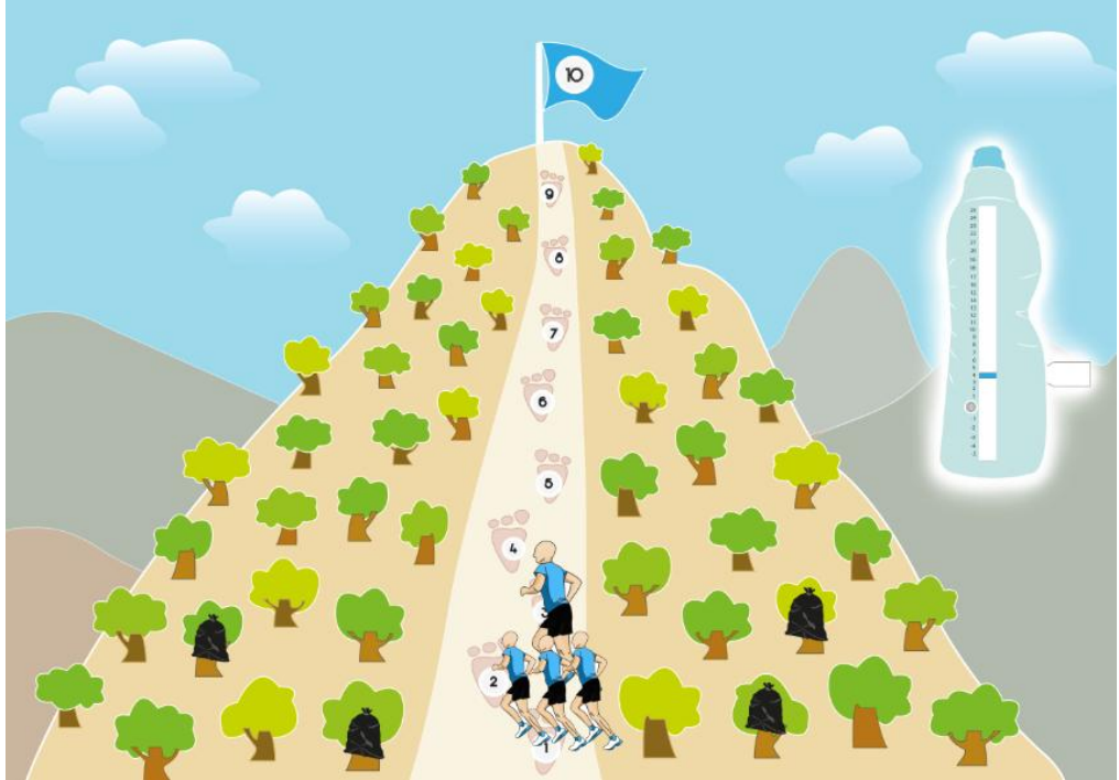
Figure 3: Board of Ekit'Eko in an ongoing game

The environment of the game is important to facilitate the immersion of participants. The metaphor of a trail was used to design all supports. The progress of the innovation is compared to the pathway of a mountain composed by several steps. The evolution of economic, social and environmental variables is respectively visible through the quantity of liquids available in an energy drink, the number of runners and the number of trashes present in the mountain. ( See Figure 3 ) Both board and video game supports are being developed so as to adapt it according to user preferences. Other ways of interactions are actually considered so as to improve the playfulness of the game: the use of corrective actions to recover points in one of the three variables, the presence of a panel sharing the progress of each team strengthening inter-group competitions and time course.