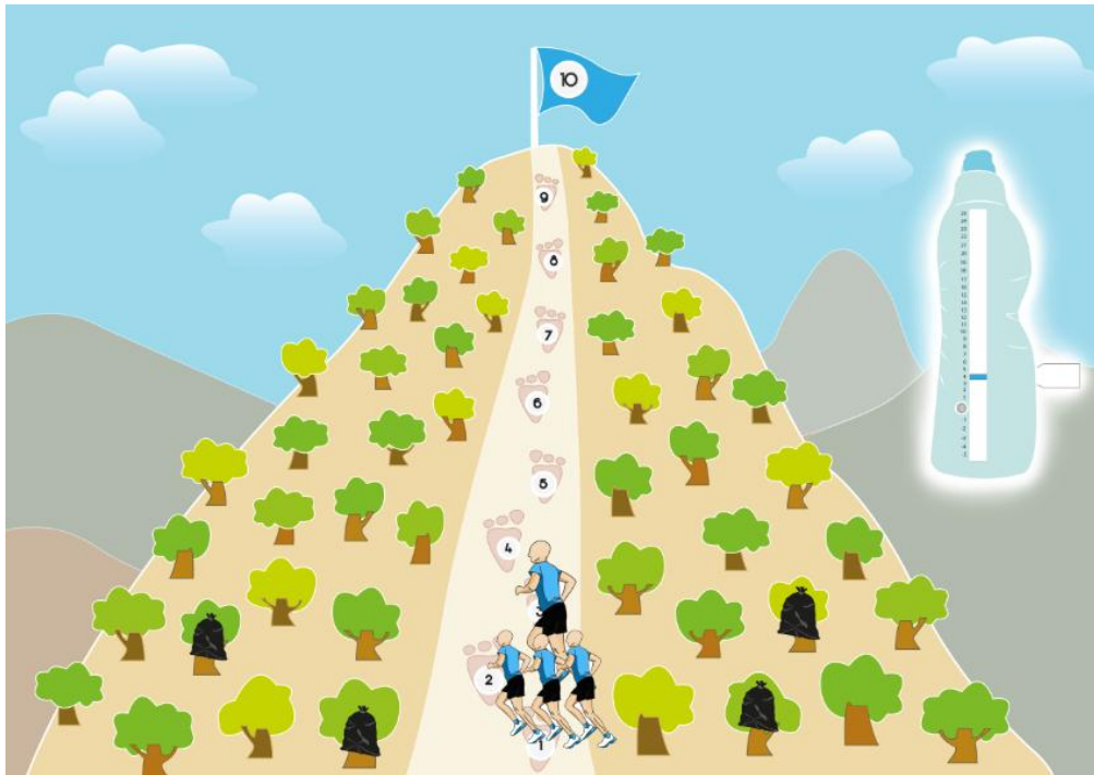
Figure 3: Board of Ekit'Eko in an ongoing game

The environment of the game is important to facilitate the immersion of participants. The metaphor of a trail was used to design all supports. The progress of the innovation is compared to the pathway of a mountain composed by several steps. The evolution of economic, social and environmental variables is respectively visible through the quantity of liquids available in an energy drink, the number of runners and the number of trashes present in the mountain. (See Figure 3) Both board and video game supports are being developed so as to adapt it according to user preferences. Other ways of interactions are actually considered so as to improve the playfulness of the game: the use of corrective actions to recover points in one of the three variables, the presence of a panel sharing the progress of each team strengthening inter-group competitions and time course.