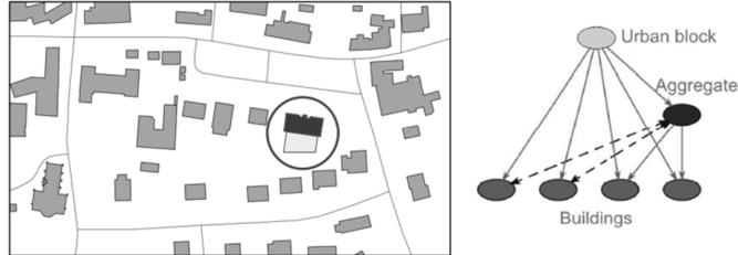
Fig. 2. Two adjacent buildings compose an aggregate. Aggregated buildings need to have normal interactions for buildings, but the aggregate also needs to interact as a whole.

In [13], other situations are exhibited. In particular, different kinds of hierarchical relations need to be modelled. An inclusion relation (i.e. a bus station on a road) [10] is different from a composition relation (i.e. a building is a part of an urban block). All these situations require a more flexible and more generic way to express relations and interactions between objects in different levels. This is why we propose to explore the use of a multi-level model.