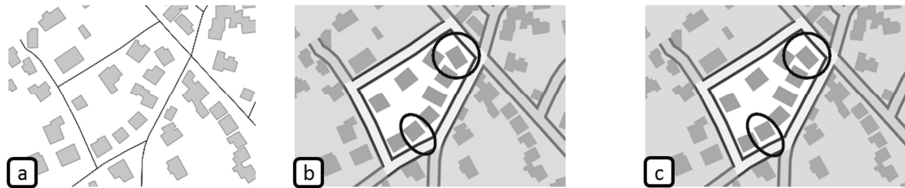
Fig. 5. (a) non-generalised data, (b) generalised data in 1:25k, using AGENT (only the central block was generalised), (c) generalised data using our PADAWAN modelling with buildings aligned to the road.

For our second experiment, we tried to mix agent behaviours stemming from both AGENT and CartACoM models, on a simple application case (to begin) that however is a remaining problem of generalisation. When generalising urban areas with buildings to a scale of 1:25k or smaller, we want to ensure that buildings almost parallel to a road change to strictly parallel. Indeed, the exact relative orientation of a building is, for this kind of scale, information surplus. Applying the rotation operation, based on a relational constraint of parallelism, is already done in rural areas using CartACoM. We want here to introduce this transformation also when generalising an urban area with the AGENT paradigm. We use the matrix given in figure 4c, and the life cycle with simple backtracking. The main difficulty was to calibrate the parameters controlling the order in which the actions are tried. This calibration was done empirically, with progressive refinement. Despite this methodology not being satisfactory, we managed to get some satisfying results, as shown in figure 5. This proves that we may add new interactions in a simple way, and opens perspectives for solving more complex problems using interactions that are not purely hierarchical or transversal.