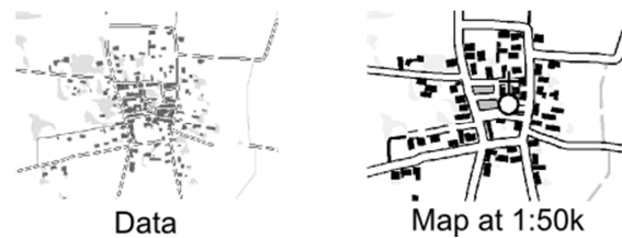
Fig. 1. Initial data generalised at the 1:50 000 scale.

All these modifications are motivated by the need to fit for the visual perception levels of the final user of the map. Yet, the information needs to remain semantically true (e.g. if the position of a building is allowed to change, it is not allowed to go to the other side of the road).