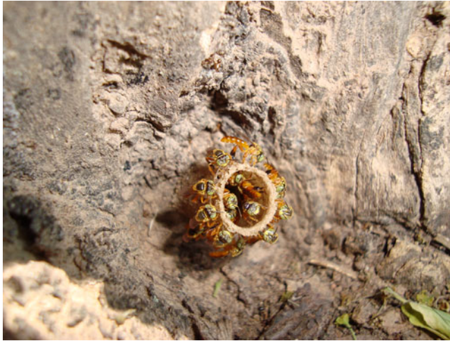
Figure 4. Nest entrance of T. fiebrigi on the base of a medium-sized living trunk of Ziziphus mistol . The entrance consists of a medium-sized tube of light cerumen. This is a docile and non-timid stingless bee.

Foragers regularly fly in and out of the nest. Nests are frequently found in living tree trunks, rare in dead tree trunks or brick walls. Slim bees, with elongated abdomen (Figure 4) ..... Tetragonisca fiebrigi