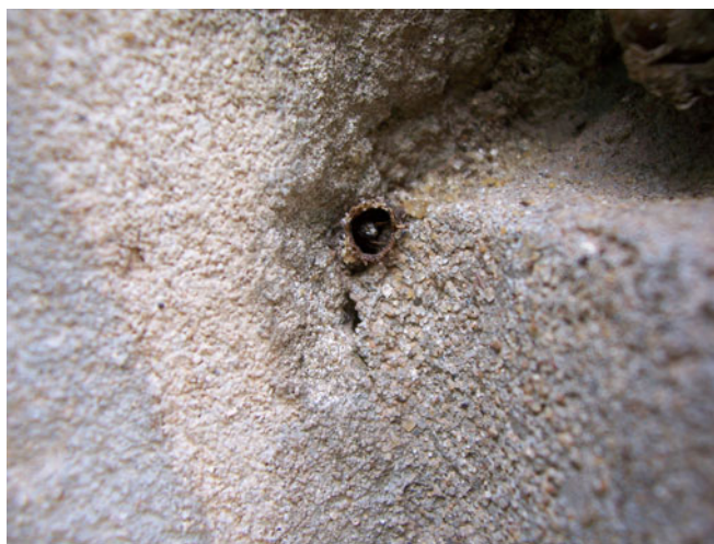
Figure 3. Nest entrance of P. catamarcensis in a brick wall substrate. The small and cryptic tube-like entrance is made of cerumen.

Robust bees. Distinct yellow bands on black abdomen..... Melipona orbignyi DD—Non-timid bees (bees apparently ignore intruders, their flight activity continues). Bees not emitting buzzing sounds. Various nesting substrates. Small bees. Abdomen without yellow bands.....E E—Some guards in hover flight in front of the nest, at about 15 cm off the nest entrance.