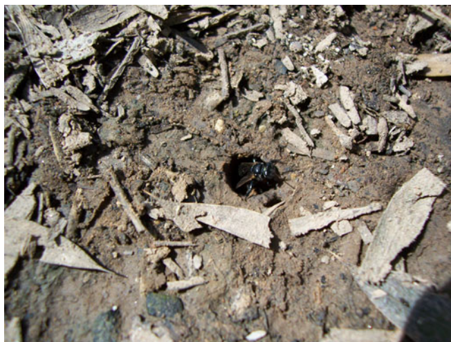
Figure 2. Nest entrance of the ground-nesting stingless bee G. argentina . A worker coming out of the cryptic and unornamented nest entrance is observed. The entrance of this particular nest lacks cerumen.

BB—Docile bees.....C C—Nesting in the ground. Black bees (Figure 2)..... Geotrigona argentina CC—Nesting in tree trunks or buildings (brick and adobe walls).....D D—Timid bees (bees avoid flight activity when an intruder approaches the nest within 5–10 m). Bees emitting buzzing sound. Nests frequently found in living tree trunks.