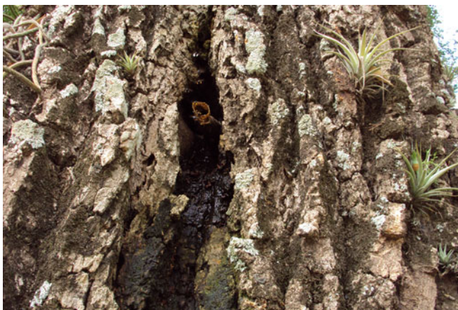
Figure 5. Nest entrance of S. jujuyensis located 5 m high along a large living tree trunk of A. quebracho-blanco . Incoming workers carrying pollen on their corbiculae can be seen.

The relationship of stingless bees with certain plant families has been reviewed by Ramalho et al. (1990) for Neotropical habitats. They found