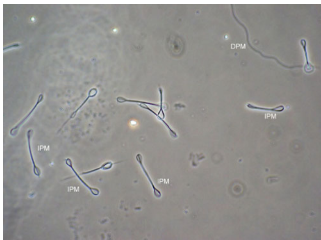
Figure 2. Swollen-tail bee spermatozoa after subjection to hypo-osmotic solution ( \times 40 ). IPM Intact plasma membrane, DMP damaged plasma membrane.

honeybee spermatozoa showed morphological changes, as evidenced by curling/swelling, when exposed to hypo-osmotic conditions in the water and HOS tests (Figure 2). The percentage of swollen-tail spermatozoa based on the water test was 92.2%. With the HOS test, the percentages at 50, 100, and 150 mOsm/kg were 94.2%, 90.5%, and 85.6%, respectively, after a 30-min incubation and 92.2%, 90.5%, and 88.0%, respectively, after a 60-min incubation. The differences in motility, the fraction of live spermatozoa, and the percentages of swollen-tail spermatozoa obtained based on the water and HOS tests for different osmolarities and incubation times were calculated (Table I). The percentage of sperm motility was lower than in viable spermatozoa using SYBR-14/PI treatment, and percentage of swollen-tail spermatozoa were highest in the water and HOS test ( P < 0.05 ). The proportion of viable spermatozoa obtained using the SYBR-14/PI treatment was lower than the proportion of swollen-tail spermatozoa based on the water and HOS tests at 50 and 100 mOsm for both incubation times ( P < 0.001 ). There was no significant difference between the fraction of swollen-tail spermatozoa obtained using the water test and the HOS test at 50 mOsm ( P > 0.05 ). An increase in the osmolarities used in the HOS test resulted in a decrease in the percentage of swollen-tail spermatozoa. The mean percentage of swollen-tail spermatozoa measured with the HOS test using 50 and 150 mOsm and a 60-