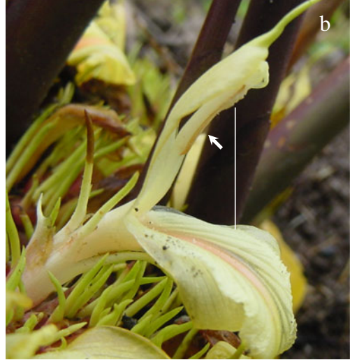
Figure 1. a Worker bumblebee foraging nectar from an A. subulatum flower in the early hours of the day; white pollen is seen on the thorax of the bee. b Flower of A. subulatum photographed at 1400 hours to show the increase in the length of the gap (indicated by the line ) between the anther–stigma column (top portion) and the labellum (bottom portion). Partially pollen-removed anther column is indicated by an arrow.

When we followed individual bumblebees (n= 128) in plantations, we found that a bee visited an average of 34.5\pm10.4 flowers in a foraging bout before exiting the spot; no more than one visit was made to an individual flower in a visiting bout, and the average time spent per flower was 20.6 s ( \pm0.26 ; n=2,702). An average of 83.09% (n=633 flowers, six plantations) of the bumblebee-visited flowers were pollinated (Table II). When we examined the efficiency of