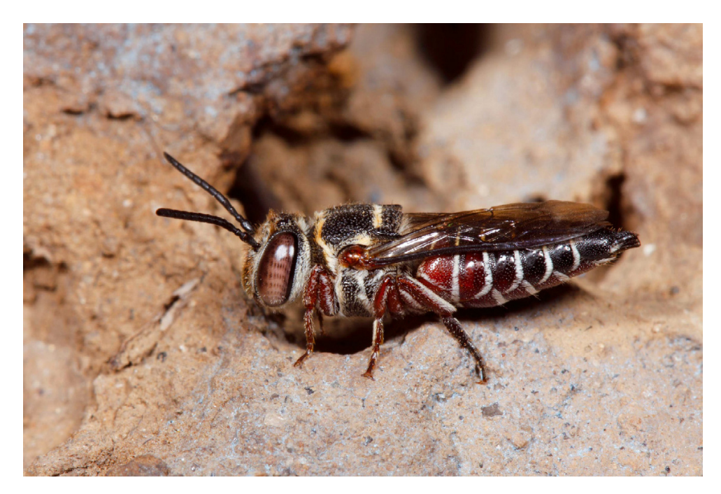
Figure 3. A female Coelioxys chichimeca waiting for a potential host bee to leave her nest.