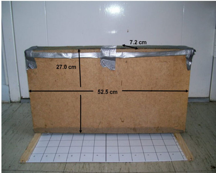
Figure 1. Wooden cage (52.5×27×7.2 cm) capable of holding one frame covered with bees.

were exposed to the gas for an additional 1.5 min. Anesthetized bees were placed inside of a plastic container sealed with a metal screen, and the bees were weighed to estimate the total of mites per unit of bee weight. The total weights of the bees ranged from 71.42 to 357.14 g. After the bees were partially revived, 30 g of powdered sugar was added to the bees inside the container. After sitting for 2 min, the container was shaken upside down multiple times, and the mites present on the adult bees were collected on a sheet of white plastic and counted. The proportion of mites removed was calculated by dividing the number of mites removed during the grooming period by the total number of mites (mites that fell during 72 h plus mites remaining on adult bees).