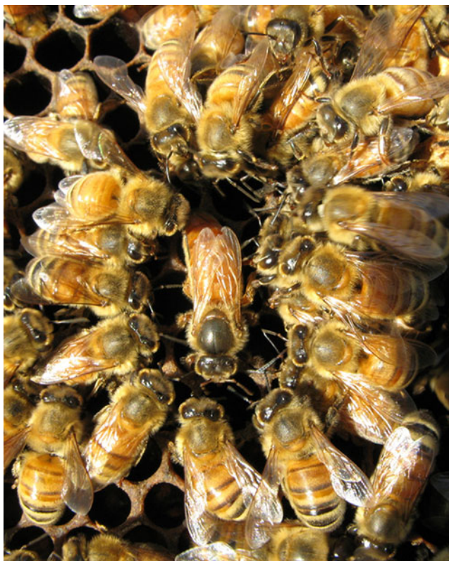
Figure 2. Retinue behaviour in a honey bee colony. Young worker bees feed and groom the queen. Her pheromone motivates them to antennate and lick her body.

by changes in the worker response threshold to QMP (Pankiw et al. 2000).