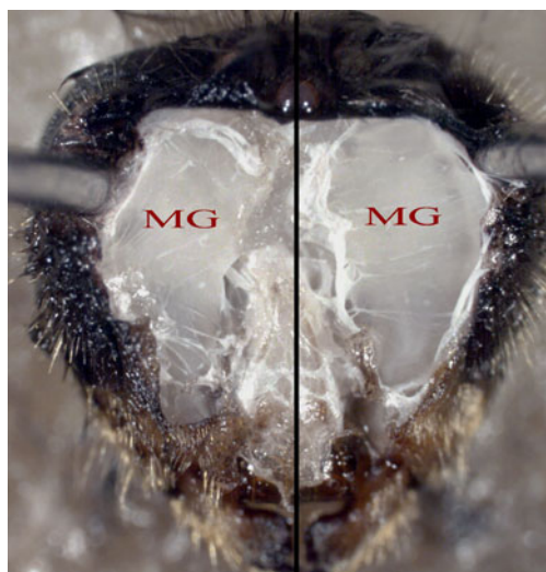
Figure 1. Anterior view of head of queen. MG indicates mandibular gland. The heads were split into two parts following the vertical black line to obtain two halves carrying either the partially ablated mandible or the intact mandible.

and secreted blend. Since the quantity of pheromone stored in a gland is two to three orders of magnitude higher than that found on the cuticle (Naumann et al. 1991), our extracts reflect the amount of pheromone synthesized by the gland. Half of the extract was evaporated under a stream of nitrogen and analyzed by gas chromatography (see Zheng et al. 2010). The following six mandibular gland components were identified based on the retention times of synthetic compounds and quantified using peak areas: 9-keto- (E) -2 decenoic acid (9ODA), 9-hydroxy-2( E )-dece-