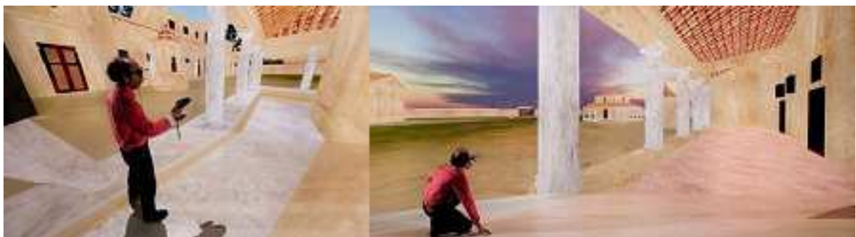
Figure 4 Exploring the Bais Gallo-Roman villa

Following a different approach, we started from a 3D model proposed by an archeologist of INRAP based on the excavation of a gallo-roman villa in Bais, France [16]. We then built an immersive application from this model, focusing on the navigation inside the site (Figure ).