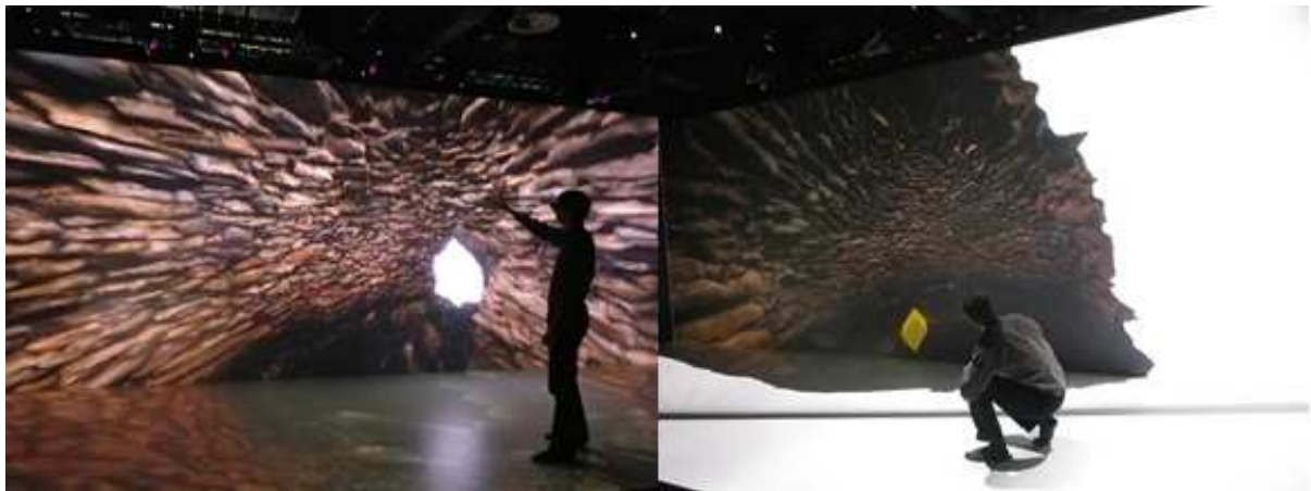
Figure 3 Immersive work in the virtual chamber of Carn

This project has with three objectives: (i) propose a common workflow to reconstruct archaeological sites as 3D models in fully immersive systems, (ii) provide archaeologists with tools and interaction metaphors to exploit immersive reconstitutions, and (iii) develop the use and access of immersive systems to archaeologists. In a first contribution [36], we proposed a procedure to model the central chamber of the Carn monument, and compare several softwares to deploy it in an immersive structure (Figure ).