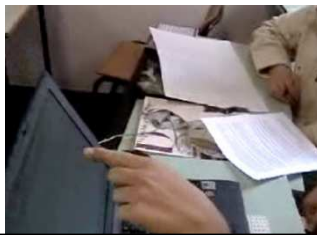
00:02 G is pointing at the line in the screen