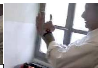
00:28 T: right hand vertically raised