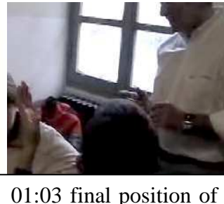
01:03 final position of G's hand after moving upwards.