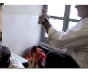
00:19 G: two two forefingers touching each other