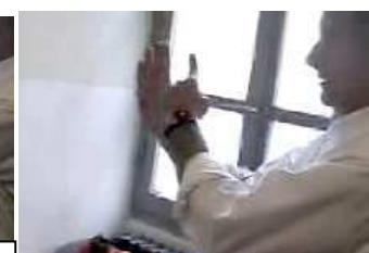
00:28 T: right hand vertically raised