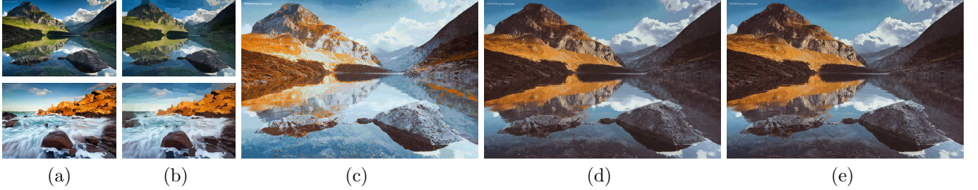
Figure 1: Color transfer process. (a) source image u and target color image v . (b) Super-pixel segmentation of u and v . Raw color transfer without (c) and with (d) relaxation (i.e. \rho = \infty and \rho = 10^3 ). (e) Final image w with post-processing.

Like [21], we use maximum likelihood estimation to incorporate geometrical information from the source image u into the synthesis process. For each pixel X = (x, u(x)) of the source image, the idea is to use the likelihood to all clusters \{X_i\}_i through the weights \{\omega_i\}_i in order to compute a linear combination of the estimated transferred colors \mathcal{T}(X_i) . Using (6), we set \forall x \in \Omega_u , w(x) = \frac{1}{W(X)} \sum_{i \in I_X} w_i(X) \mathcal{T}(U_i) , with w_i(\cdot) = \exp(-\frac{1}{2} \|\cdot - X_i\|_{V_i}^2) , and the normalizing factor W(X) = \sum_i w_i(X) .