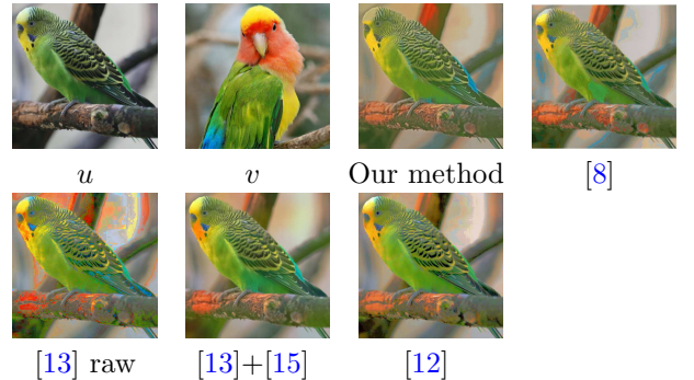
Figure 2: Comparison of out approach with [13] (without and with the post-processing of [15]), [12], and [8].

the incorporation of image details in the model to avoid the final post-processing step and the preservation of contrast.