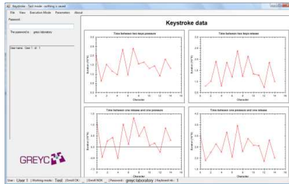
Fig. 1. GREYC keystroke software

The data that we had obtained from the 5 passphrases as listed in Table 2 are keystroke dynamics data, as mentioned earlier in the article. Keystroke dynamics data consist of information containing a field of four timing values namely: the timing pressure of when the two buttons are pressed ( ppTime ); the timing release of when the two buttons are released ( rrTime ); the timing of when one button is released and the other is pressed ( rpTime ) that is the latencies between keystrokes; and the timing of when one button is pressed and the other is released ( prTime ) that is the time durations of keystrokes [5, 6]. These data however, do not match exactly to the durations and latencies of keys because their ordering is based on time and not key code [5]. We use the keystroke template vector , which is the concatenation of the four mentioned timing values to perform our data analysis by classifying two classes for each category.