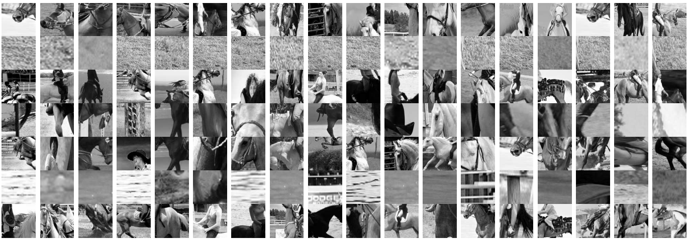
Fig. 2. This figure shows the highest scoring regions for a set of parts learned for the riding horse action. Each row correspond to a part