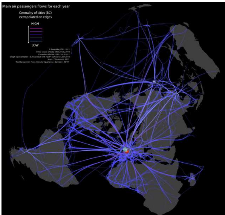
Figure 2: Polar projection and edge bundling