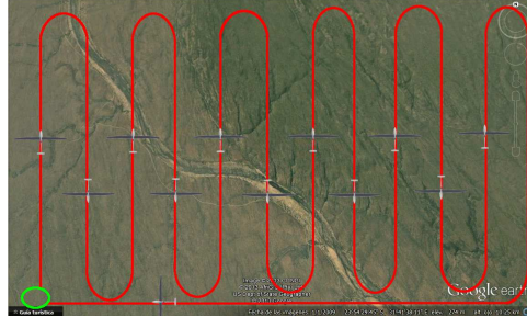
Fig. 1. Autonomous patrol flight plan - the entire area will be inspected in one round

Nowadays the huge zones of National parks in Africa is inspected, in most of the cases, by a limited number of humans patrolling in group, using ground vehicles and binoculars and facing constant danger in face of unscrupulous poachers. One potential contribution of the NOAH project is to reduce the number of people needed to cover the different parts of the Natural Parks. Furthermore, the use of the UAVs will significantly reduce the amount of time needed to check if there are potential poachers in a specific sector of the Park. Finally, from a bird view it should be easier to detect potential poaching situations.