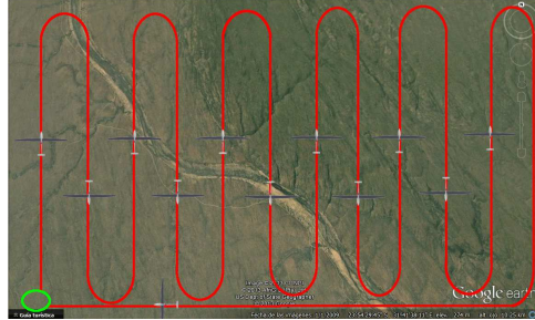
Fig. 1. Autonomous patrol flight plan - the entire area will be inspected in one round

Nowadays the huge zones of National parks in Africa is inspected, in most of the cases, by a limited number of humans patrolling in group, using ground vehicles and binoculars and facing constant danger in face of unscrupulous poachers. One potential contribution of the NOAH project is to reduce the number of people needed to cover the different parts of the Natural Parks. Furthermore, the use of the UAVs will significantly reduce the amount of time needed to check if there are potential poachers in a specific sector of the Park. Finally, from a bird view it should be easier to detect potential poaching situations.