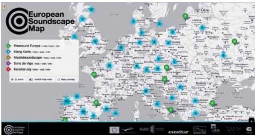
Screen copy of the European Soundscape Map, Mashup Mode