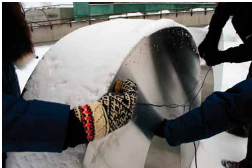
Contact microphones ready for action.