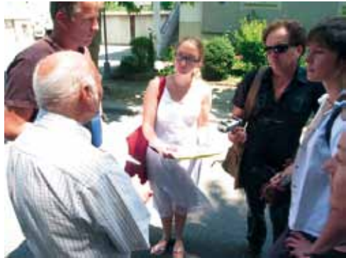
Students and staff of Cresson interviewing for a survey.