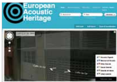
Screen copies of the European Soundscape Map