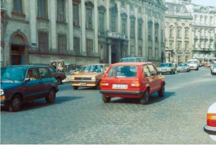
Picture taken during a recording in 1980-1983 at the square “Freyung”.