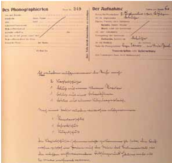
Original protocol of Phonogramm 249

“noises, shouts, etc.” had their own category next to speech and music. Later in the course of anthropological, folkloristic, or musicological data acquisition, some Austrian researchers sporadically recorded “work shouts” (Ph 4265, B 5251), environmental sounds (bells: B 58, B 5945),