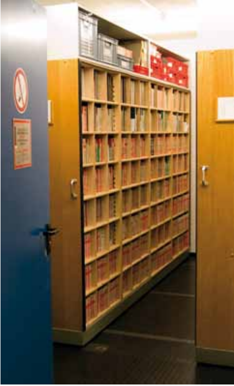
Storage system for original audio tapes in the Phonogrammarchiv.