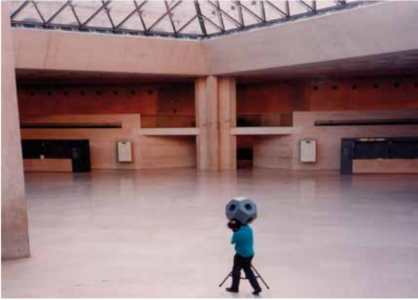
Preparing for an acoustic measurements set up under the Pyramide of Louvre, Paris.