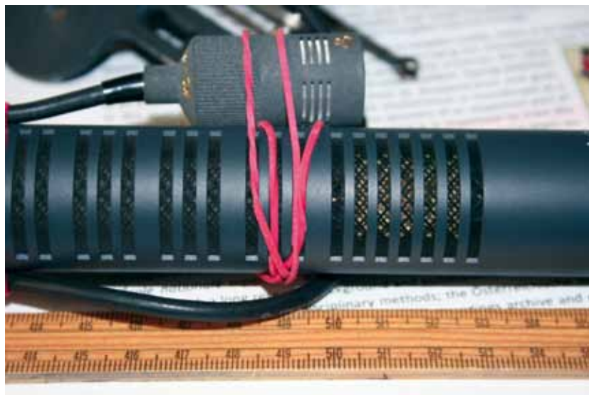
Double-MS setup

The Double-MS setup was chosen because it is frequently used in documentary film making, i.e. location recording. Being a coincident technique, it is easily portable and rather unobtrusive. It is also perfectly mono and stereo compatible and does not relate to a specific loudspeaker configuration. Although it requires matrixing, the rules for matrixing are very simple (open standard) and can be done with any mixing console, analogue or digital. For our Double-MS, we had a Neumann RSM191 (which combines a short lobe with two cardioid capsules for the “S”-signal