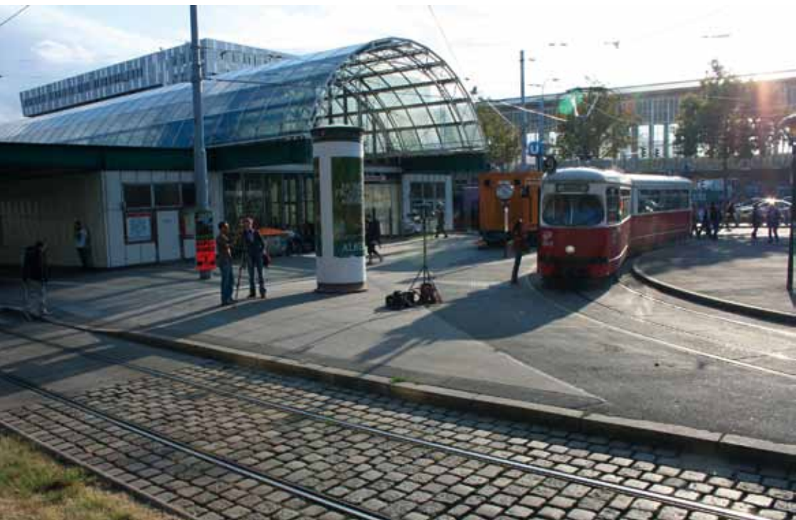
Surround sound recording for the EAH project at the Westbahnhof.

complemented by the intimate expertise in signal extraction of analogue data carriers, a knowledge fading elsewhere in an increasingly digitised environment.