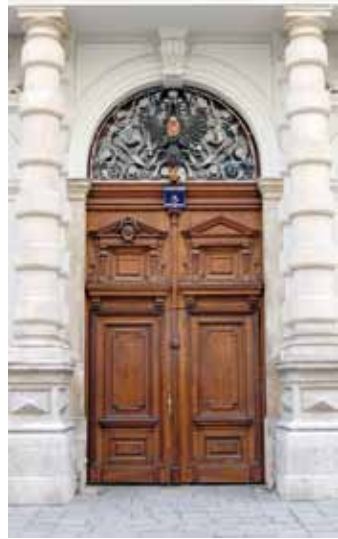
Door of the building Liebiggasse 5 in Vienna, where the Phono- grammarchiv resides since 1927.