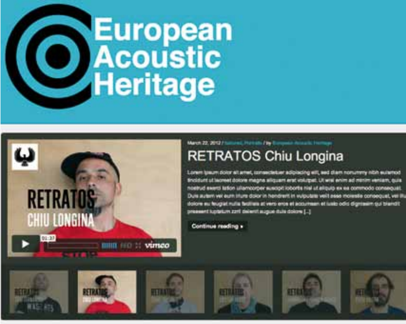
Screen copy of the European Soundscape TV

to connect it with the sound localized on the map and also, by using the research tool, to connect it with other interviews in Europe that deal with the same subject. We can say that it is a way to pinpoint, on a very small scale, acoustic heritage to better compare it with others countries or regions in Europe. For example, we started with interviews realized in the school of Architecture at Grenoble, in France. There, some people described the acoustic heritage of the place by describing all the sounds of a city surrounded by mountains. The interview is by itself very interesting, but, with the SoundscapeTV, we wish to connect this expression of heritage with other expressions that are, somewhere else, similar. This the purpose of Soundscape TV.