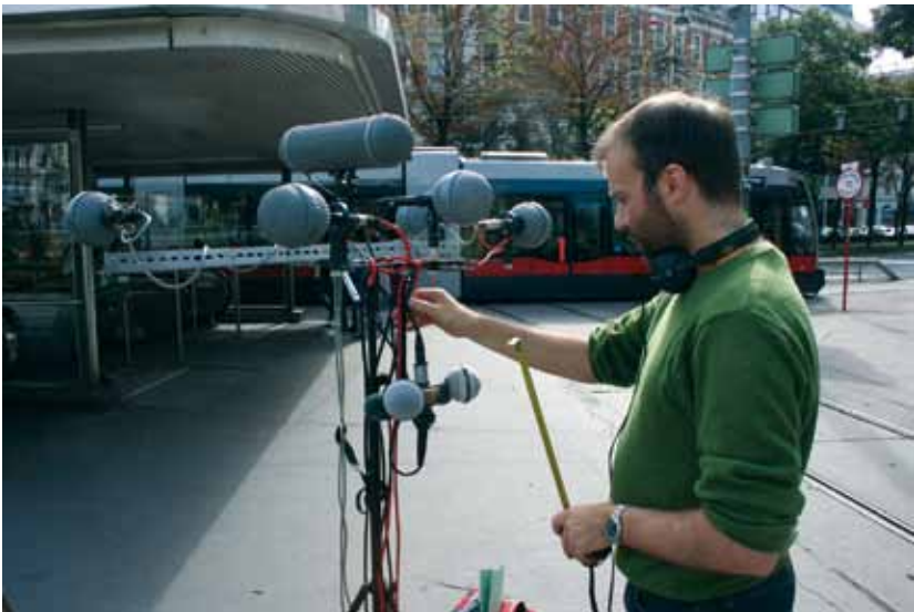
OCT, Soundfield, and Double-MS

When comparing the recording setups, especially when making soundscape recordings simultaneously with three different systems, practicability is an important topic. The equipment has to be lightweight, small and unobtrusive, and, in addition, it should have the potential to be operated by non-technicians. The output quality must be a linear format (LPCM). OCT is out of the question due its enormous size and dramatic