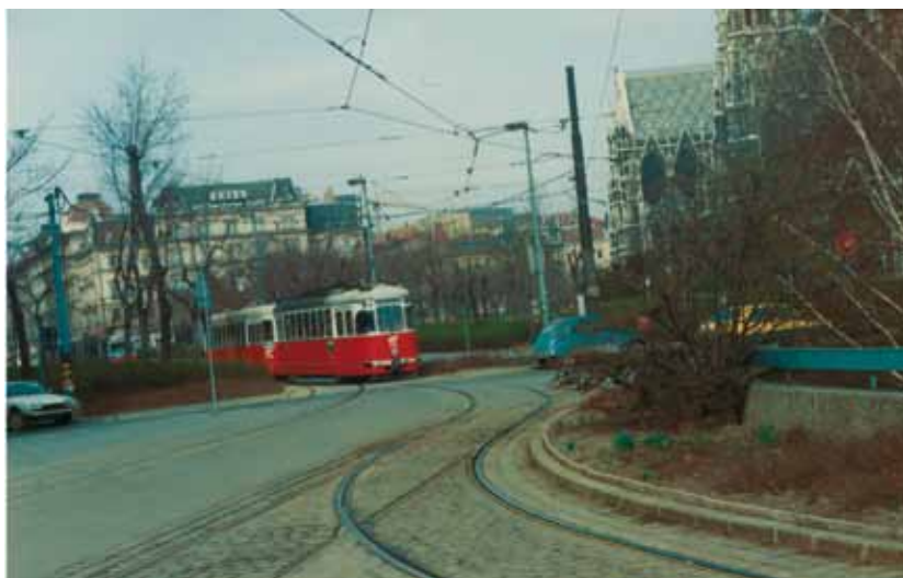
Tram 43/44, stop “Schottentor”, 1980-1983.