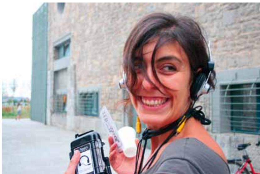
On a NoTours walk.