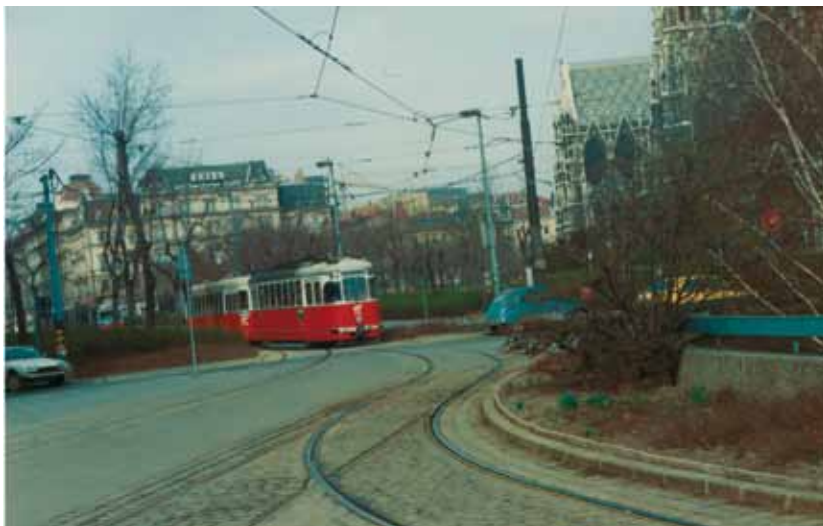
Tram 43/44, stop “Schottentor”, 1980-1983.