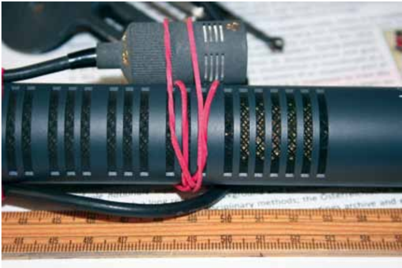
Double-MS setup

The Double-MS setup was chosen because it is frequently used in documentary film making, i.e. location recording. Being a coincident technique, it is easily portable and rather unobtrusive. It is also perfectly mono and stereo compatible and does not relate to a specific loudspeaker configuration. Although it requires matrixing, the rules for matrixing are very simple (open standard) and can be done with any mixing console, analogue or digital. For our Double-MS, we had a Neumann RSM191 (which combines a short lobe with two cardioid capsules for the “S”-signal