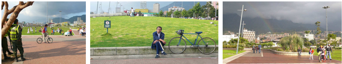
Figure 2. Renovated public spaces in Tercer Milenio Park

Tercer Milenio Park is centrally located two blocks west of the presidential palace. Before its transformation under the Peñalosa administration, it had been a low-income district. Proposals to turn the area into a park had already been made in 1947 and 1960, as many considered state intervention necessary in a zone that had been identified as problematic as early as the 1940s, and that, despite being one of Bogotá's oldest districts, had never been recognized as a legitimate part of the city's heritage (Perilla, 2007). Until the nineteenth century, the district of Santa Inés, site of today's Tercer Milenio Park, was an area both rural and poor. As the city started to grow, mercantile activities expanded northward leaving Santa Inés neglected. The district of Santa Inés became more recently a center for illegal activities and experienced increased rates of violence, homelessness, and instability. Known as the Cartucho , the zone increasingly served to concentrate marginal sectors that included poor families, cooperatives of recyclers, and local mafias, and was marked by drug dealing, prostitution, and homelessness. Physically, the area became highly deteriorated. Located just blocks away from the presidential palace, the zone was beyond legal control. It presented a major obstacle to revitalization plans for the city center.