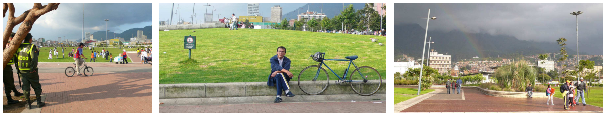
Figure 2. Renovated public spaces in Tercer Milenio Park

Tercer Milenio Park is centrally located two blocks west of the presidential palace. Before its transformation under the Peñalosa administration, it had been a low-income district. Proposals to turn the area into a park had already been made in 1947 and 1960, as many considered state intervention necessary in a zone that had been identified as problematic as early as the 1940s, and that, despite being one of Bogotá's oldest districts, had never been recognized as a legitimate part of the city's heritage (Perilla, 2007). Until the nineteenth century, the district of Santa Inés, site of today's Tercer Milenio Park , was an area both rural and poor. As the city started to grow, mercantile activities expanded northward leaving Santa Inés neglected. The district of Santa Inés became more recently a center for illegal activities and experienced increased rates of violence, homelessness, and instability. Known as the Cartucho , the zone increasingly served to concentrate marginal sectors that included poor families, cooperatives of recyclers, and local mafias, and was marked by drug dealing, prostitution, and homelessness. Physically, the area became highly deteriorated. Located just blocks away from the presidential palace, the zone was beyond legal control. It presented a major obstacle to revitalization plans for the city center.