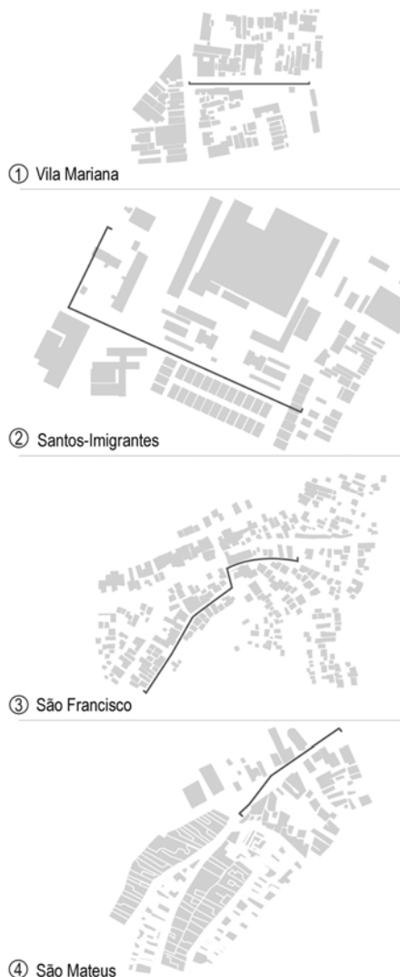
Figure 2: Block plans of the four selected neighborhood. The sections lines are represented in black.

Vila Mariana (#1 on Fig. 1 and 2) is a central neighborhood in São Paulo. Rich buildings and houses are located along a sloping street. We were able to interview someone living in a rich and secure building where the access is controlled by a guard. We also interviewed an employee of this building whose job is to collect twice a day the waste on every doorsteps, to stock it and select it in the basement, and carry it out on the collecting days (three times a week).