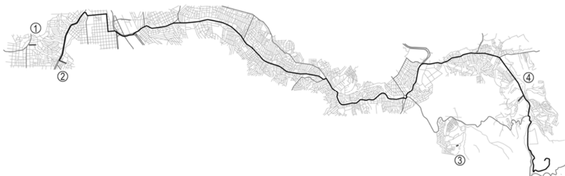
Figure 1: Map of East part of São Paulo agglomeration. The thickest line represents the way followed by garbage trucks from transbordo (#2) to sanitary landfill (spiral at the right end of the line).