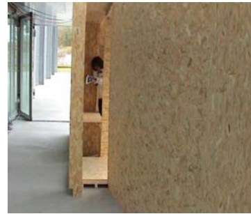
Figure 9: A corner offers another form of inclusion in the room, the body is settled in this corner to speak on the phone.