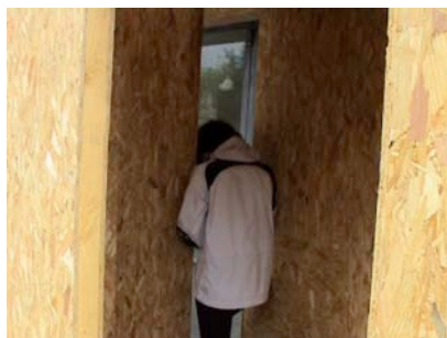
Figure 8: A void between two walls offers a position using the phone and speaking : the body and the head are between two walls. This position shows a particular way to form an envelope all around the head ; the position is precise because it changes very fast if the head and the ears are too far from the