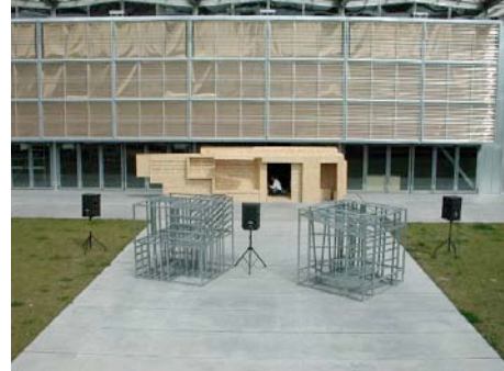
Figure 3 & 4: Wings side & Installation with Speakers