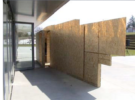
Figure 1 & 2: Front side & ridge