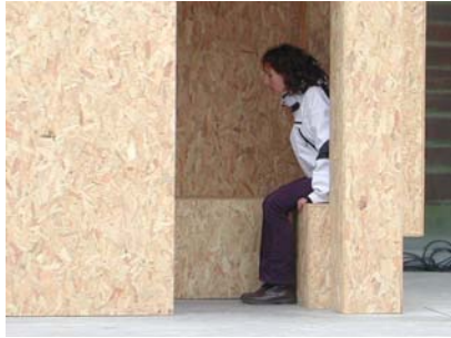
Figure 6: Trying to sit body bent toward the outside. This kind of little moves illustrates the sensitivity to the limits of the sonic environment depending on the sitting depth.

The following pictures illustrate the different kinds of attitude that make interact form, environment and active uses: