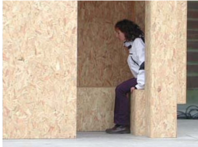
Figure 6: Trying to sit body bent toward the outside. This kind of little moves illustrates the sensitivity to the limits of the sonic environment depending on the sitting depth.

The following pictures illustrate the different kinds of attitude that make interact form, environment and active uses: