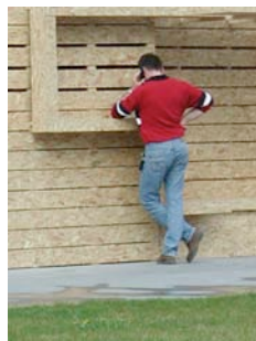
Figure 7: Turning the back to the sound front and facing the wall, the speaker uses this position to talk : the body and the wall make a niche and the whole allows speaking. The first sonic reflections of his voice on the wall give a return to it. During the whole reading, the speaker doesn't move while the ambient sound increases.