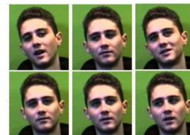
Figure 3. Samples from FACES94