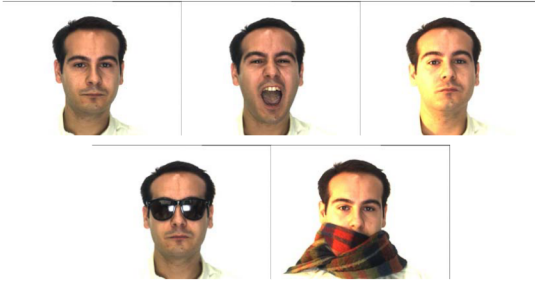
Figure 5. Samples from AR