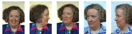
Figure 4. Samples from FERET