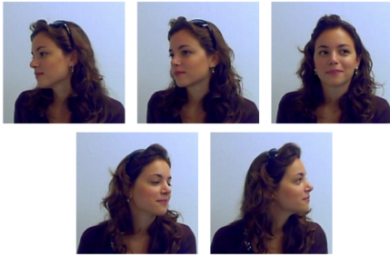
Figure 6. Samples from ENSIB

We apply the generic biometric system described in Figure 1 on one color component. This comparative study has aim to determine the color components (i.e. transformation) that provide the best performance for face verification. Results have to be considered relatively to each others. We describe the performance of one color component based on the EER value (Equal Error Rate). It corresponds to the behavior of a biometric system for the value of the decision threshold set as a compromise between the FAR (False Acceptance Rate) and the FRR one (False Rejection Rate). We use a single image for the enrolment, that means no learning is realized (the reliability of the color space is not biased). Table 1 gives the performance of each color component for the four benchmark databases. We can see first that the performance of the generic system