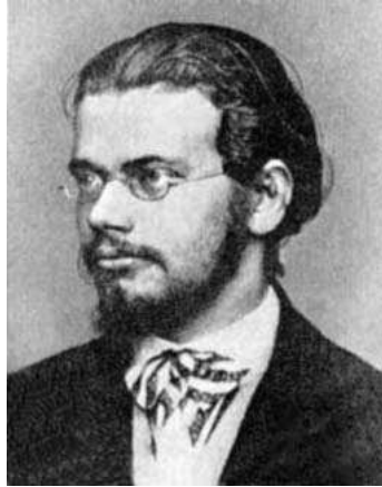
Ludwig Boltzmann (1844–1906)

Der zweite Hauptsatz der mechanischen Wärmetheorie Lecture at the Festive Session, Imperial Academy of Sciences