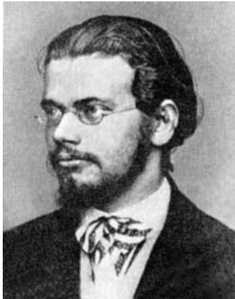
Ludwig Boltzmann (1844–1906)

“Boltzmann summarized most (but not all) of his work in a two volume treatise Vorlesungen über Gastheorie . This is one of the greatest books in the history of exact sciences and the reader is strongly advised to consult it. It is tough going but the rewards are great 3 .”