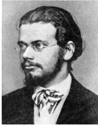
Ludwig Boltzmann (1844–1906)

“Boltzmann summarized most (but not all) of his work in a two volume treatise Vorlesungen über Gastheorie . This is one of the greatest books in the history of exact sciences and the reader is strongly advised to consult it. It is tough going but the rewards are great 3 .”