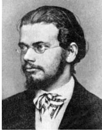
Ludwig Boltzmann (1844–1906)

“Boltzmann summarized most (but not all) of his work in a two volume treatise Vorlesungen über Gastheorie . This is one of the greatest books in the history of exact sciences and the reader is strongly advised to consult it. It is tough going but the rewards are great 3 .”