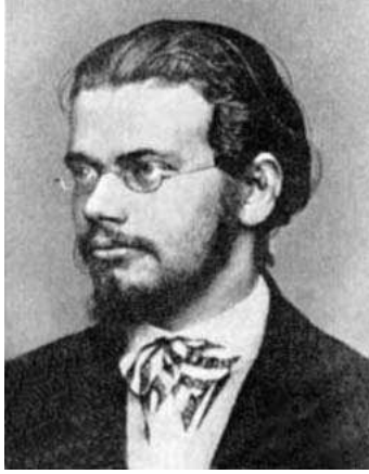
Ludwig Boltzmann (1844–1906)

“Boltzmann summarized most (but not all) of his work in a two volume treatise Vorlesungen über Gastheorie. This is one of the greatest books in the history of exact sciences and the reader is strongly advised to consult it. It is tough going but the rewards are great 3 .”