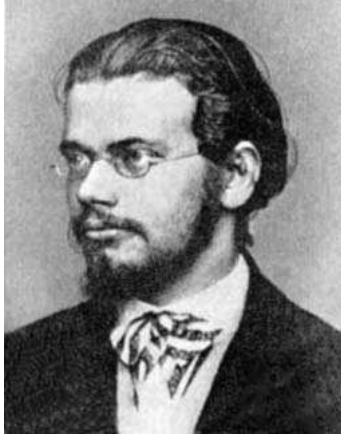
Ludwig Boltzmann (1844–1906)

“Boltzmann summarized most (but not all) of his work in a two volume treatise Vorlesungen über Gastheorie . This is one of the greatest books in the history of exact sciences and the reader is strongly advised to consult it. It is tough going but the rewards are great 2 .”