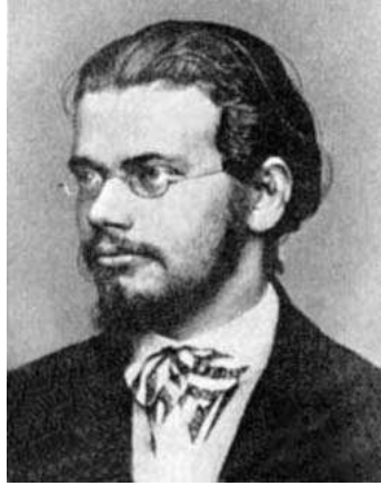
Ludwig Boltzmann (1844–1906)

“Boltzmann summarized most (but not all) of his work in a two volume treatise Vorlesungen über Gastheorie . This is one of the greatest books in the history of exact sciences and the reader is strongly advised to consult it. It is tough going but the rewards are great 2 .”