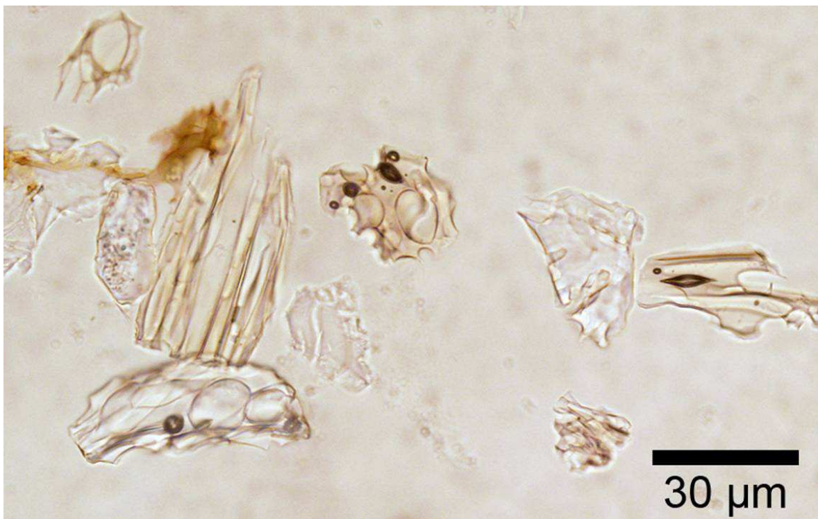
Figure 1. Photograph showing tephra shards with characteristic fluted and vesicular morphologies. The shards are from a currently unidentified tephra layer from the Shetland Isles, UK.

Specific minerals may be helpful in distinguishing volcanic centres when glass shards are absent or in such a low concentration that they do not allow for a subsequent chemical investigation. For example, titanite is a typical